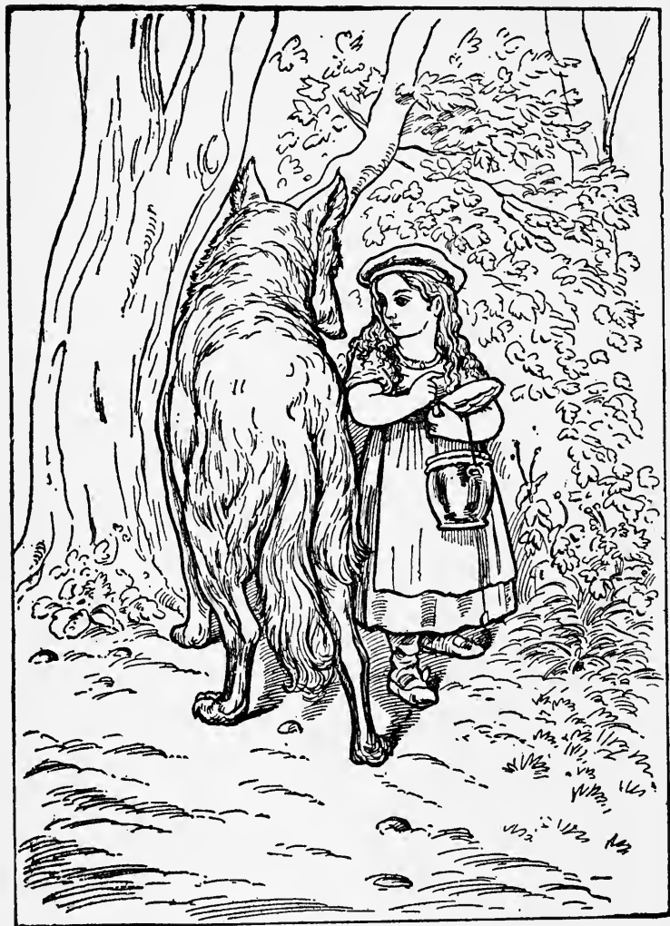
"SHE MET WITH GAFFER 'WOLF.'"